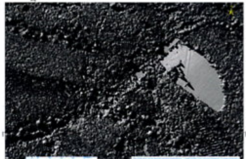
Above: Vegetation-covered landscape. Below: same landscape modelled to reveal hidden features.